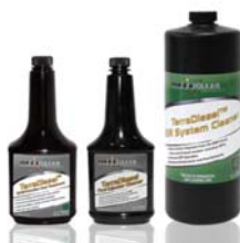
TerraDiesel Complete Diesel Preventive Maintenance Kit - Part # 201295