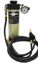
TerraDiesel 4000 Service Machine - Part # 500-4006T