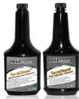
Minor Diesel Service Kit - Part # 201265

The Minor Diesel Fuel Kit combines Multi-Function Fuel Treatment and Fuel Injector Cleaner. TerraDiesel Fuel Injector Cleaner improves engine performance in as little as 2 hours. It will remove gums, varnishes and carbon deposits from fuel system component including injectors, pump, turbochargers and EGR valves. It will significantly lower emissions and improve performance in as little as 2 hours of operation.