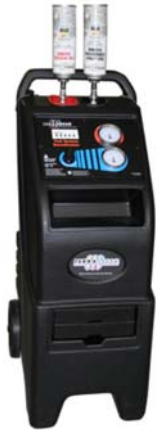
TerraClean Decarbonizing Machine - Part # 201160