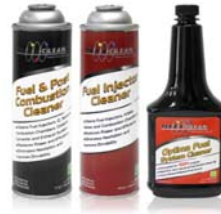
Major Decarb Kit - Part # 201212 Major Decarb Kit - Part # 201412 for engine 2.0L and below

This is an ideal kit for those that want to offer a premium 2-part decarbonizing service. It combines the cleaning power of Fuel injector Cleaner and Fuel & Post Combustion Cleaner. When used with the TerraClean Decarbonizing Machine 201160, TerraClean Fuel System Cleaner clean injectors, intake valves and the continues the cleaning process, Chemically binding to and combusting carbon deposits, revitalizing the fuel system while also cleaning Oxygen sensors and the catalytic converter.