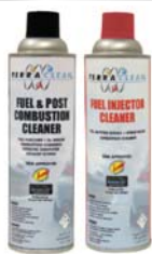
Premium Tune Up Kit - Part # 201200 Premium Tune Up Kit - Part # 201400 for engine 2.0L and below

The TerraClean Fuel System Decarbonizer's revolutionary technology goes beyond that of "traditional decarbonizers" by removing carbon deposits from the entire fuel system, including catalytic converters and O2 Sensors. Where other systems use harsh additives, TerraClean decarbonizes the entire fuel system using technologically advanced chemistry that is safe for the technicians, the vehicle components and the environment. As well, unlike solvent or detergent based cleaners which can increase emissions during and after service, virtually no noxious emissions are emitted during a TerraClean service. Used in conjunction with the Premium Tune Up Kit 201200 .