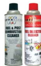
Super Strength Tune Up Kit - Part # 201200X

The TerraClean Pressurized Induction Tool helps you perform an effective induction service on Direct or Conventional Fuel Injected Engines. After filling the tool's cylinder with TerraClean Intake Valve and Deposit Cleaner 201230 , it is pressurized using shop air. The S-Tool is placed inside the intake past the Mass Air Flow Sensor and a fine spray of cleaner is introduced into the system. The intake valve deposit cleaner is sprayed on to the valves, ensuring that they are cleaned of hard carbon deposits that negatively impact effective combustion. Alternatively, using the Vacuum line attachment, the tool can be connected through a vacuum line, allowing for a faster introduction of the chemical into the air intake.