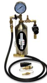
Pressurized Induction Tool - Part # 201145