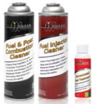
Minor Decarb Kit - Part # 201202

This Kit combines the Fuel Injector Cleaner and Fuel & Post Combustion Cleaner with Concentrated Fuel Treatment. It is designed to deliver a complete decarbonization while eliminating the harmful effects of water and ethanol in the fuel, after using Fuel injector cleaner and Fuel & Post Combustion Cleaner to complete the carbonization, Concentrated Fuel Treatment is added to the fuel.